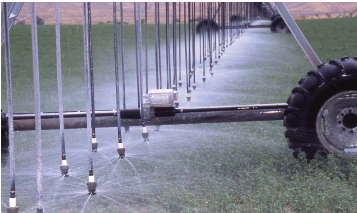
A low-energy, precision watering device irrigates an alfalfa field in Newberry Springs, Calif., part of a SARE grant project teaching farmers how to use soil moisture sensors to conserve water.

Published by the Sustainable Agriculture Network (SAN), the national outreach arm of the Sustainable Agriculture Research and Education (SARE) program, with funding from the Cooperative State Research, Education and Extension Service, USDA.